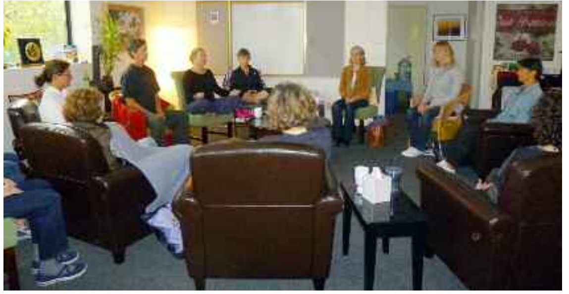
Participants in the Moraga meditation circle.